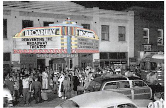
Broadway Theatre in Cape Girardeau, Missouri.