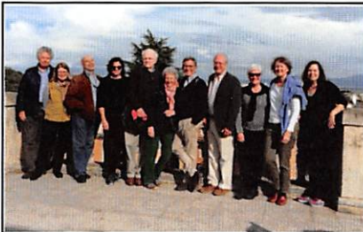
Fitch Trustees and friends on the roof of the American Academy in Rome